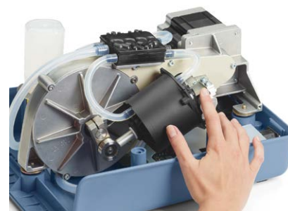
High-quality, durable components

Medela's 50+ years of experience in medical vacuum led us to refine the drive unit in the Basic suction pump. The cylinders' heat-resistant high-tech material supports long-lasting, dependable operation. A flat spring with patented technology is just one of the many features integrated into this pump.