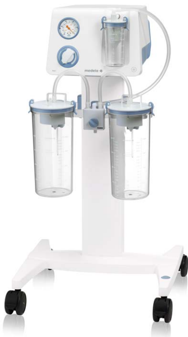
Basic – Surgical Suction Pump