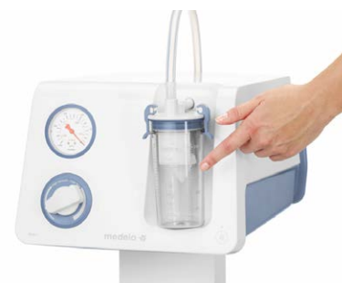
All operating elements located in front of pump

The Medela Basic suction pump is hygienic, reliable and easy to use. Its membrane vacuum regulator builds up the vacuum within seconds, making the Basic suction pump suitable for applications that demand rapid suction and quiet operation. The pump is available in rack, portable and mobile models for convenient placement in endoscopy towers, at the patient's bedside or in the operating theatre. Complete the unit with the Disposable or the Reusable Fluid Collection System from Medela's wide range of accessories.