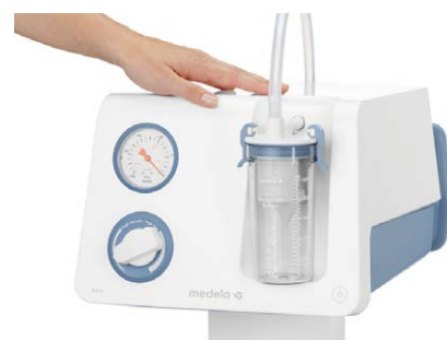
Hygienic single-piece hood design

The smooth, single-piece hood design of the pump facilitates cleaning. Materials able to withstand potent disinfection agents were chosen. The CleanTouch on/off button on the housing allows you to switch the pump on and off with a simple touch: no gaps, no grooves. The foot on/off switch integrated into the trolley leaves hands free for surgery.